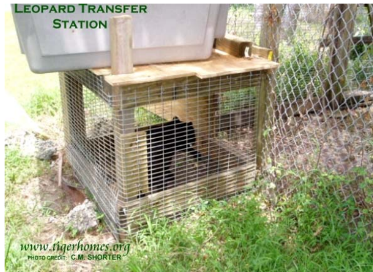
Midnight playing "Hide & Seek"