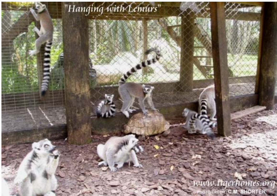
"HANGING WITH LEMURS"