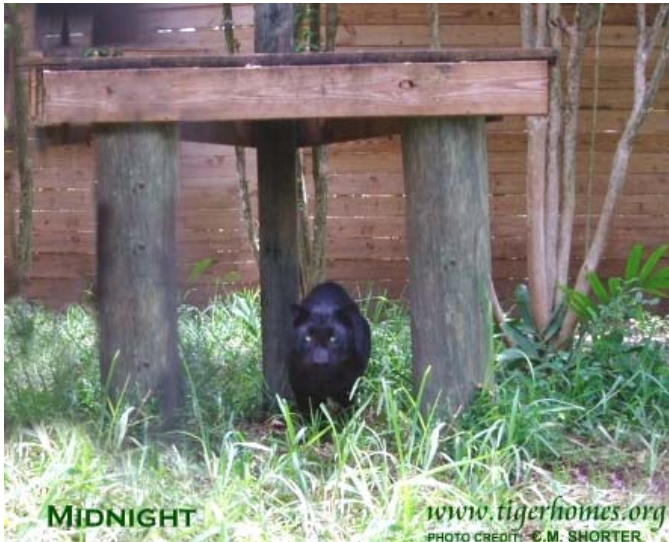
Midnight getting ready to give one of her famous "Leopard Lunges" ~ YIPES!