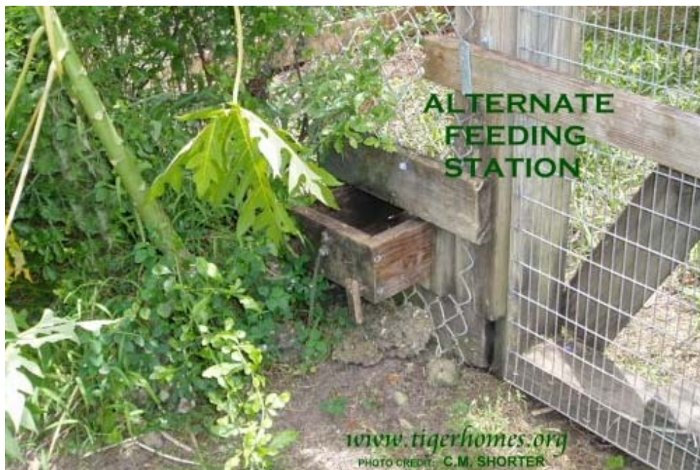
Feeding Stations are installed in all of the Big Cat habitats and used occasionally. Dave much prefers "tossing" their food to them allowing the Big Cats to catch it and make a quick job of devouring their "chow". From the close-up here, you can see the solid construction of the habitats.