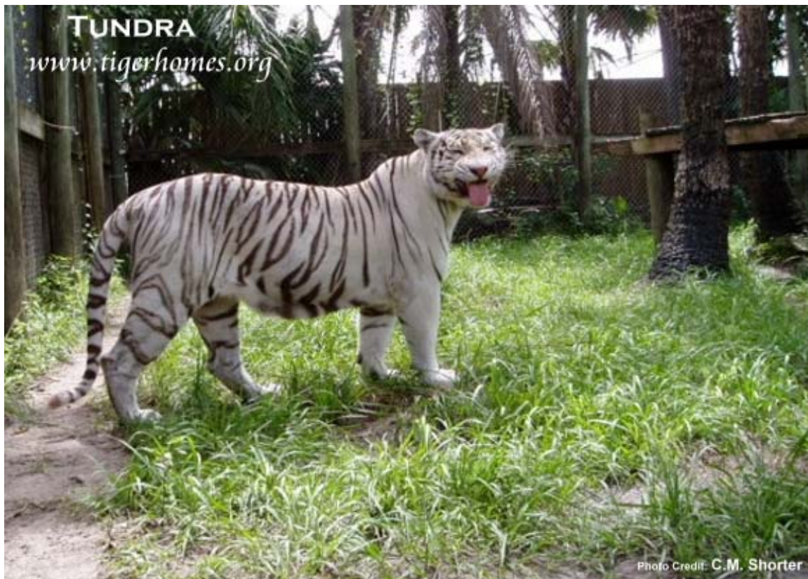
“Tiger Greetings” from Tundra!

Here you see a BIG TIGER WELCOME! WHAT A FACE! This is Tundra, TigerHomes female White Siberian Tiger entering the large Tiger Habitat from the relay station. She sets off immediately to explore her territory. You see their beauty but you can actually “feel their power”. It is an incredible and awesome experience to stand before them. Visits are a rare privilege and it is preferred that way since the Sanctuary is private and the animals have peace & quiet with no daily parade of visitors. With TigerHomes Webcams we can watch them all day without disturbing them! Dave recently installed Night Lights in the White Tiger habitat for great evening viewing.