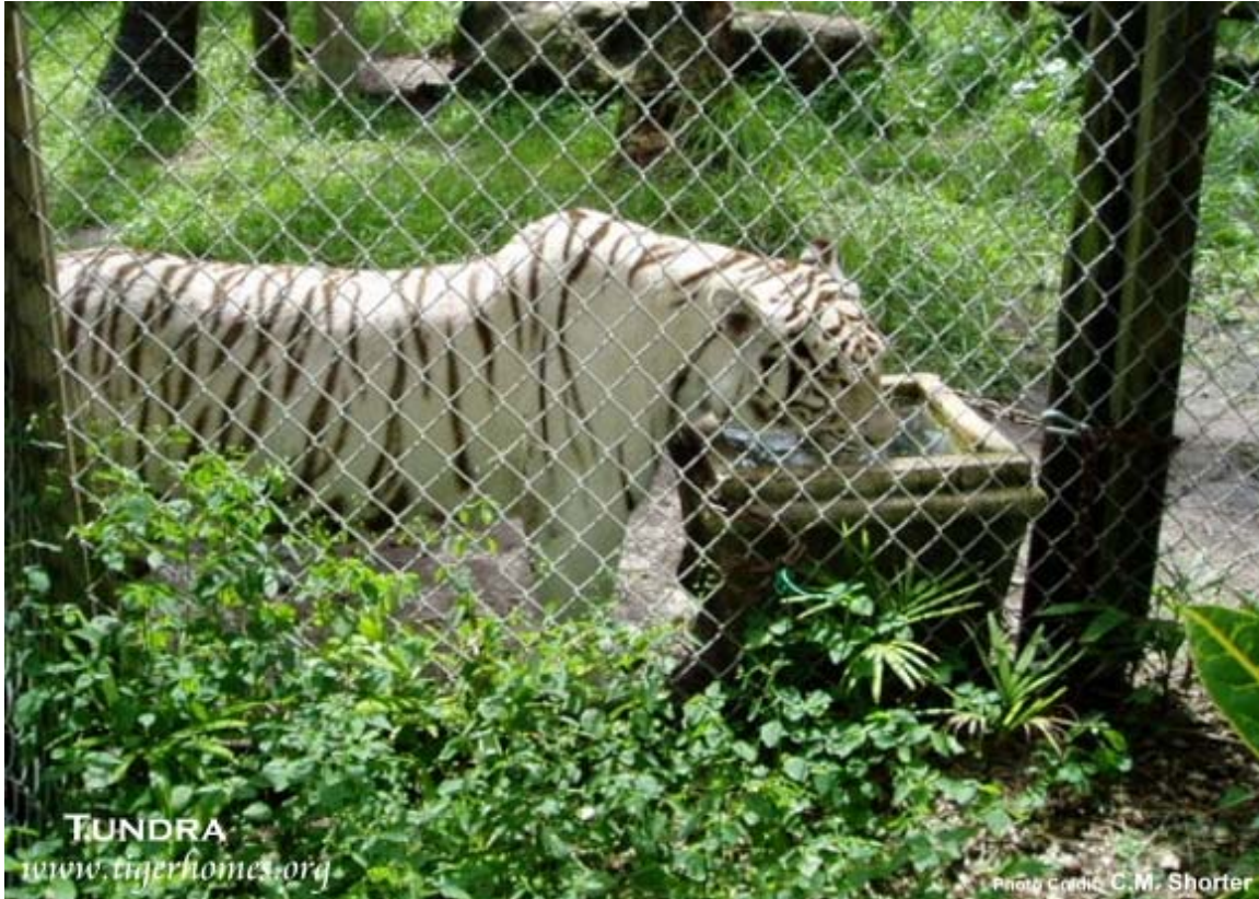
TUNDRA – STOPPING FOR A LONG, COOL DRINK OF WATER