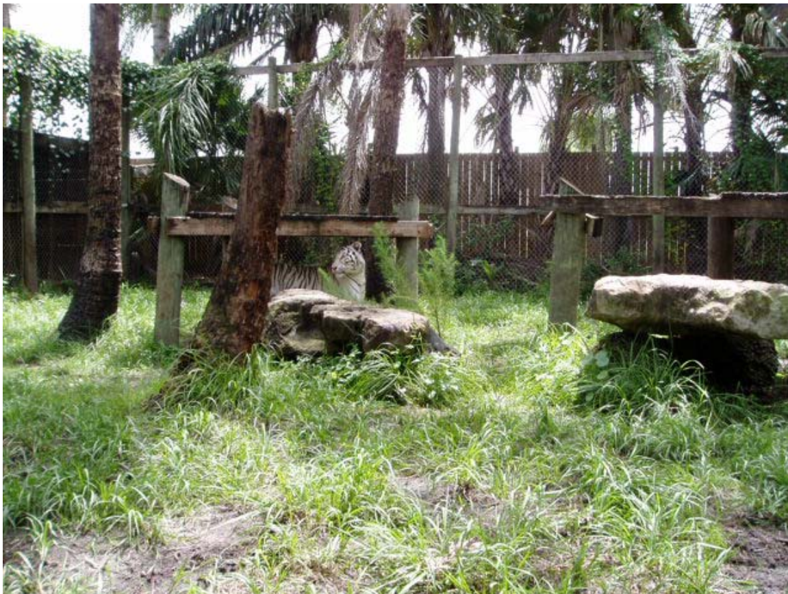
TUNDRA – ENJOYING AN AFTERNOON STROLL